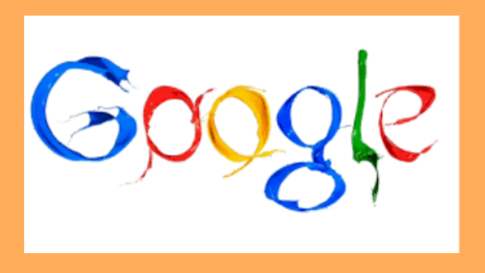
Aug 8-3:04 PM