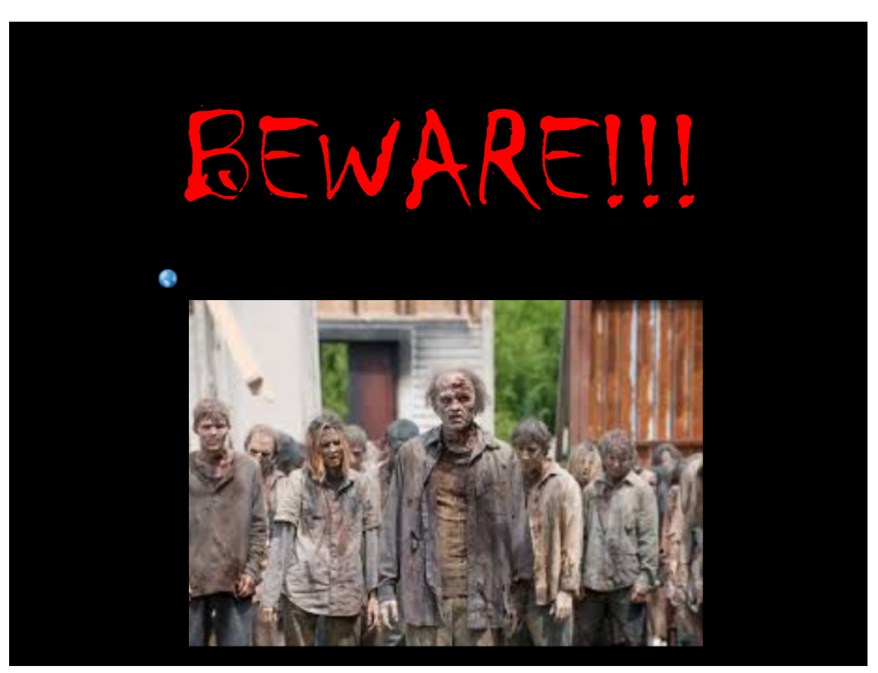
Aug 8-3:02 PM